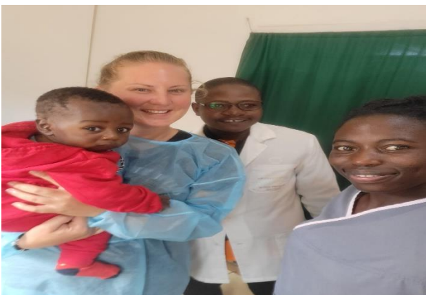
Immunization and pads distribution at Esikoma Primary School