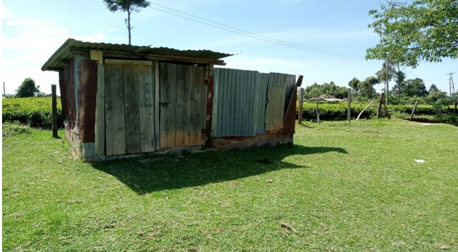
Dilapidated toilet that seeks for refurbishment