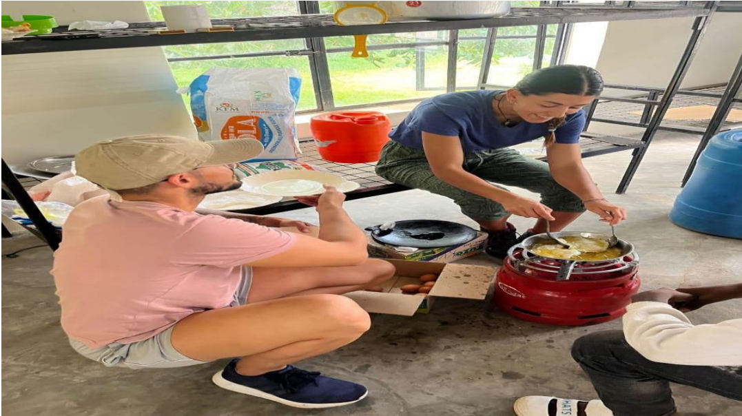
Volunteers preparing their meals at the workcamp

PROJECT PARTICIPANTS: Maximum 20 volunteers from Kenya and the international community