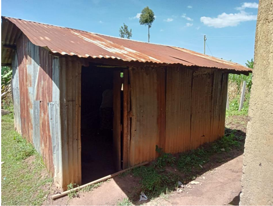
Dilapidated school infrastructure that requires refurbishment

PROJECT PARTICIPANTS: Maximum 20 volunteers from Kenya and the international community